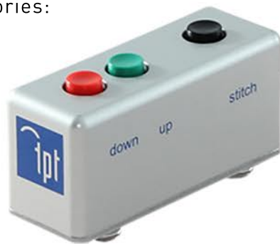
H25 Dynamic Search