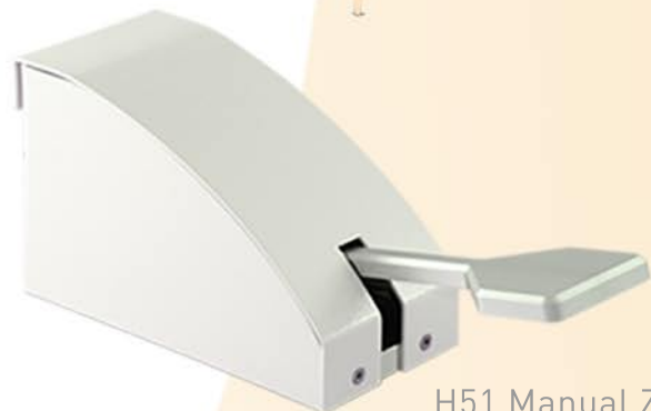
H51 Manual Z

Specifications are subject to change without prior notice