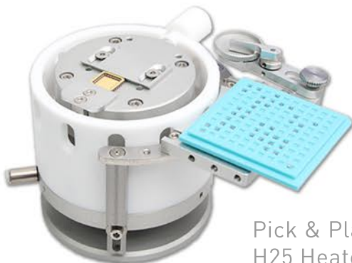
Pick & Place H25 Heaterstage